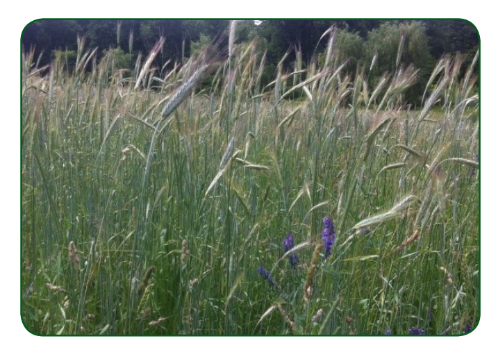
FIGURE 2. Mix of winter rye, wheat, barley, and hairy vetch. Cover crop mixes are an excellent way of accumulating plant biomass to build organic matter, alleviate compaction problems, feed soil microbes and suppress disease.

FIGURE I. The soil respiration measurement is an indicator of soil microbial abundance and activity. A larger, more active community will maximize soil functioning such as accepting and using residues and making nutrients readily available for plants.