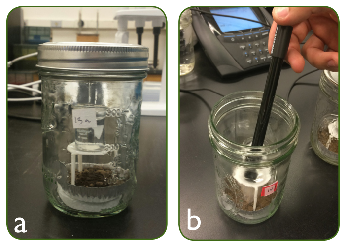
FIGURE 3 a and b. Soil Respiration is measured by capturing and quantifying CO<sub>2</sub> released from samples.